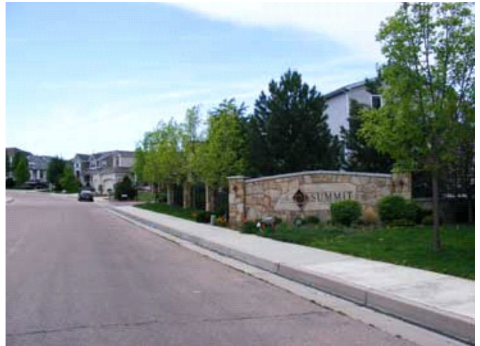
The Summit at Vista Mesa

As the summer approaches it's mid-point, it is hard to believe that we need to start looking to make preparations for the next year. We are beginning to work on next year's budget, the November annual meeting and most of all, we are looking for ambitious neighbors in the community to step forward to help with the HOA. With two Board positions becoming available, it is imperative that we fill these positions in order to keep our HOA active. The two departing Board members have been involved with the Board for more than 10 years combined. I am certain that most of you have seen the benefits of having an active HOA. With training available through CAI (Community Associations Institute), it can be a rewarding experience and gives the volunteer a sense of accomplishment and pride in their community. The alternative to volunteers is to turn it